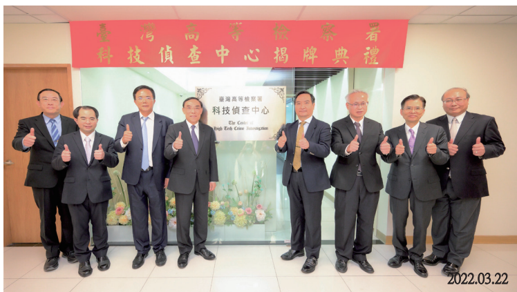
High Tech Crime Investigation Centerre were grand opened -B

Taiwan High Prosecutors Office Organization and Operational Duties Office of Administration