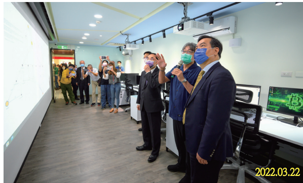
High Tech Crime Investigation Centerre were grand opened -A