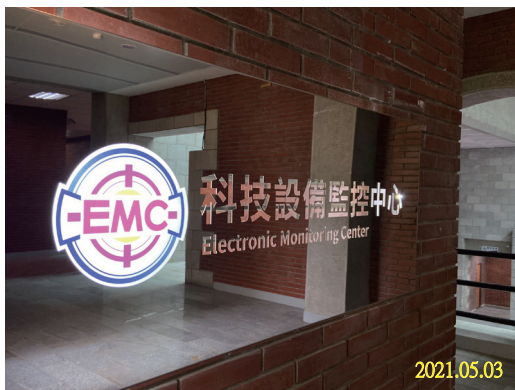
Entrance of Electronic Monitoring Center

To prevent putative defendants not in custody or on bail from absconding and fleeing the jurisdiction during the investigation, prosecution or trial phase, and avoiding criminal liability under false names, given the ever advancing state of technology, and to meet future scientific and technological advances, there exists the necessity of employing appropriate technological monitoring and surveillance methods to defendants in conformity with the provisions of Article 116-2, Paragraph 1, Subsection 4 of the Code of Criminal Procedure providing: In granting the suspension of detention, the court may, after considering the protection of human rights and public interests and deeming it necessary, designate a considerable period of time and order the defendant to comply with the following matters: 4. Accept appropriate monitoring by technical equipment. And the same law in Article 117-1, Paragraph 1 provides: The provisions of the preceding two articles shall apply mutatis mutandis to the situations where the public prosecutor releases the accused on bail, to the custody of another, or with a limitation on his residence in accordance with the proviso of section III of Article 93, or section IV of Article 228.