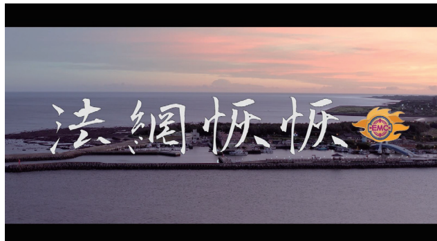
EMC has produced a micro film named, "The Long arms of Law" to demonstrate that the net of law may be wide but everyone gets it at the end.