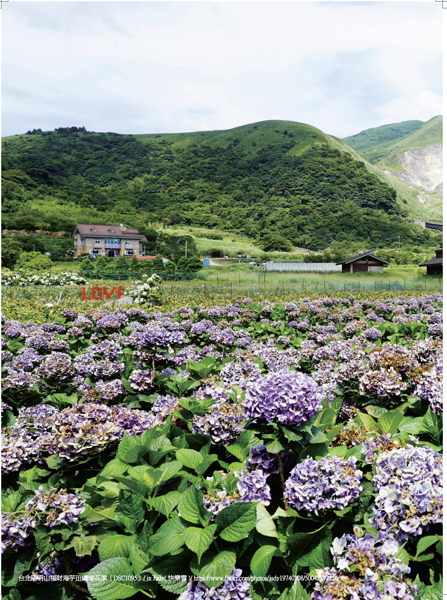
台北陽明山福財海芋田繡球花季 (DSC1095)