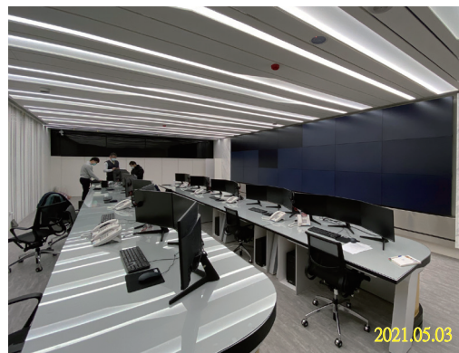
Main monitoring room