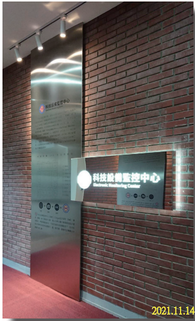
EMC Image Wall The upper half of the wall is the history of EMC, the middle is the map of the EMC, and the lower half of the wall if the logo.

Taiwan High Prosecutors Office Organization and Operational Duties Office of Administration