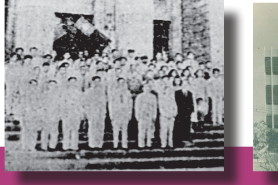
Photo taken at the entrance of the building on the day of the opening