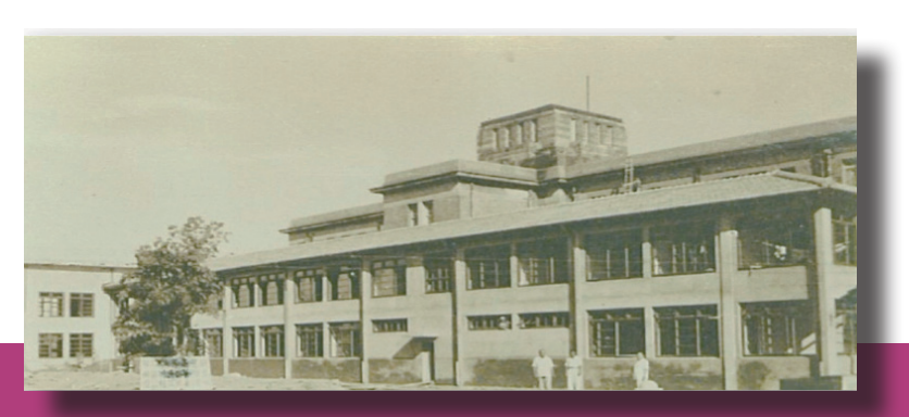
The construction status of the newly added office building in 1953

Affected by the Baihe Earthquake in 1964, cracks were incurred for the front building of the office of the Branch Court and the Prosecutors Office. As the building was severely damaged, it was planned to demolish the front building and reconstruct a reinforced concrete three-story office building on the original site, which was later completed and open for use as of December 17, 1965.