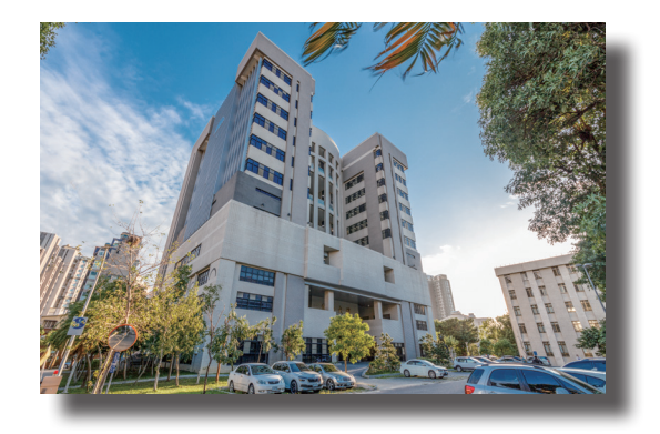
New Investigation Building

The front entrance of the building of the Court and the Prosecution establishments established in 1989