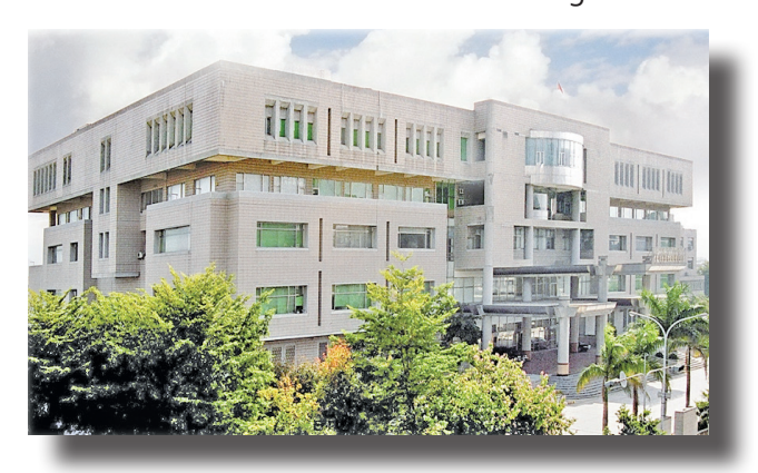
The current office building of the Miaoli District Prosecutors Office