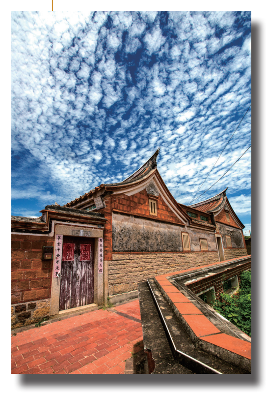
An elegant historical residence which was completely preserved • kinmen(完整唯美的古 厝 • 金門)

The jurisdiction of the Kinmen Prosecutors establishment covers Jincheng Township, Jinhu Township, Jinsha Township, Jinning Township, Lieyu Township, and Wuqiu Township in Kinmen County.Section 3 Office Buildings